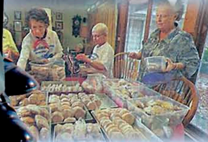
Babe made sure the Troops got Homemade Cookies