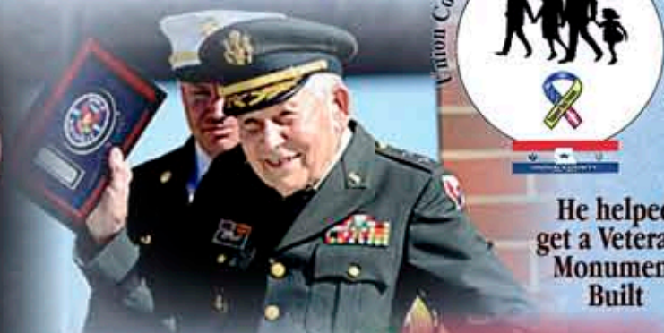
He helped get a Veterans Monument Built